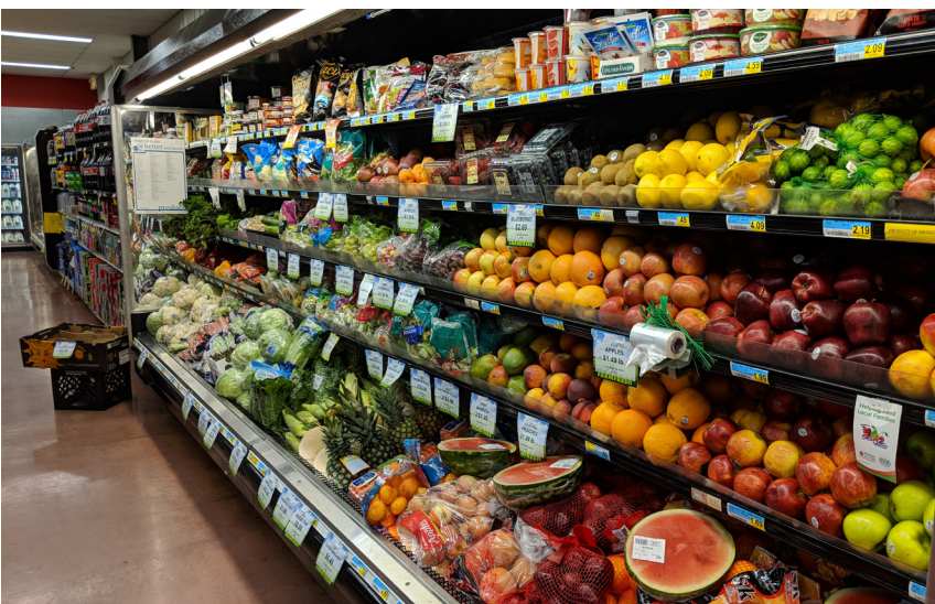
The produce section in Hired Man's Grocery & Grill, Inc.

This region of Kansas has a rich agricultural heritage. Sumner County is sometimes referred to as the "Wheat Capital of the World." Much of the land surrounding Conway Springs is farmed in wheat. Otherwise, residents are likely to commute 30 miles into Wichita for work.