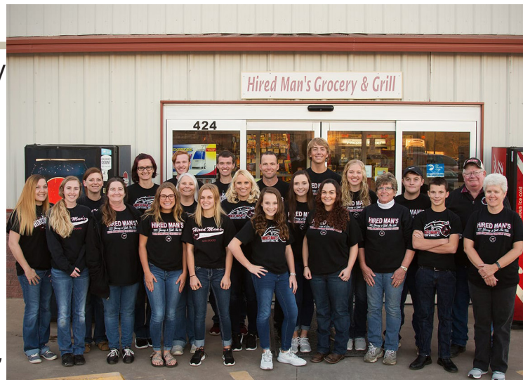
Hired Man's Grocery & Grill, inc. employees pose in front of the store.